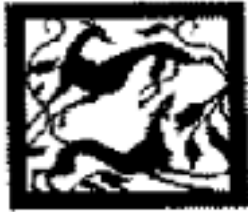
Native American Prayer

I give you this, one thought to keep, I am with you still, I do not sleep.